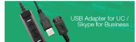
USB Adapter for UC / Skype for Business