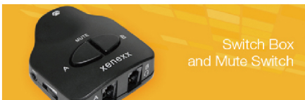
Switch Box and Mute Switch