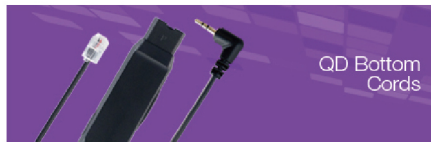
QD Bottom Cords